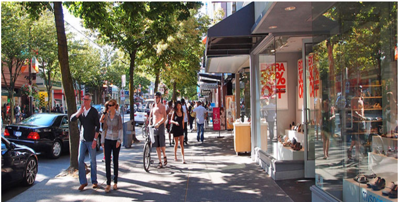
Robson Street (Robson & Burrard Streets)

With BC Place Stadium at one end, Stanley Park at the other, and the city's best-known shopping precinct in between, Robson Street is a must-stroll for most visitors to Vancouver. One of Vancouver's oldest commercial streets, it was once known as Robsonstrasse for the sheer number of German and European stores that opened up after the Second World War. The international character of the street still exists. Being right in the heart of the downtown core, you'll find yourself walking right alongside locals on their way to the office, sports fans heading to the game, and Asian students lining up outside noodle shops.